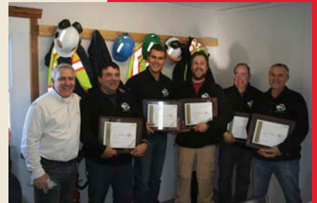
Photo 4: IAG supervisors and project team awarded MBA certification.