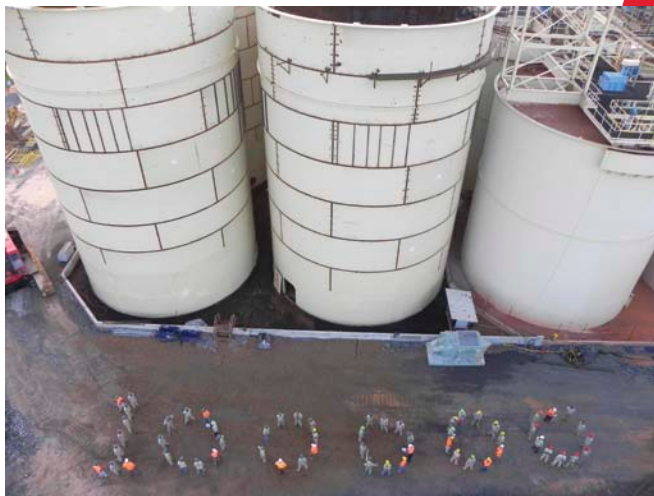
Photo 1: Teams celebrate 100,000 hours at zero harm at their construction site in Suriname.